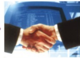
Final Product Approval