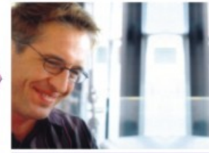
Approval of Design