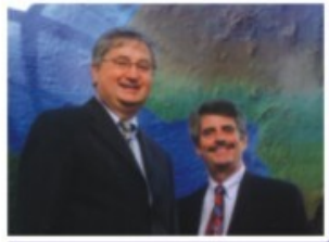
Understanding Customer Requirements

All developments at Regent follow a systematic procedure to ensure a higher level of product quality, timely launch schedule and Total Customer Satisfaction which gets us repeat business !