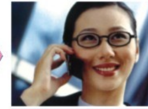
Approval of Cost