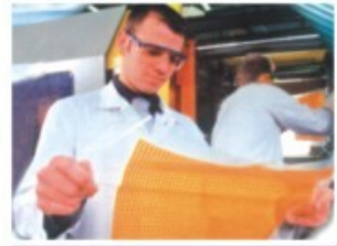
Developing Drawings of Products