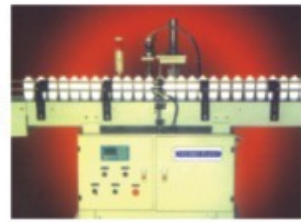
Line Trial at Customer's End