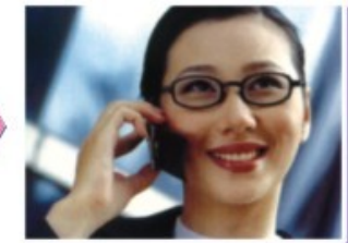
Approval of Cost