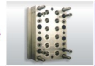
Multi Cavity Mold